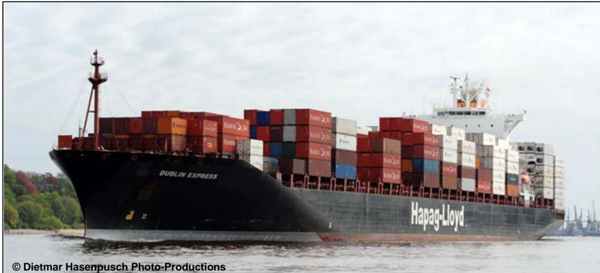
Figure 1: Photo of DUBLIN EXPRESS