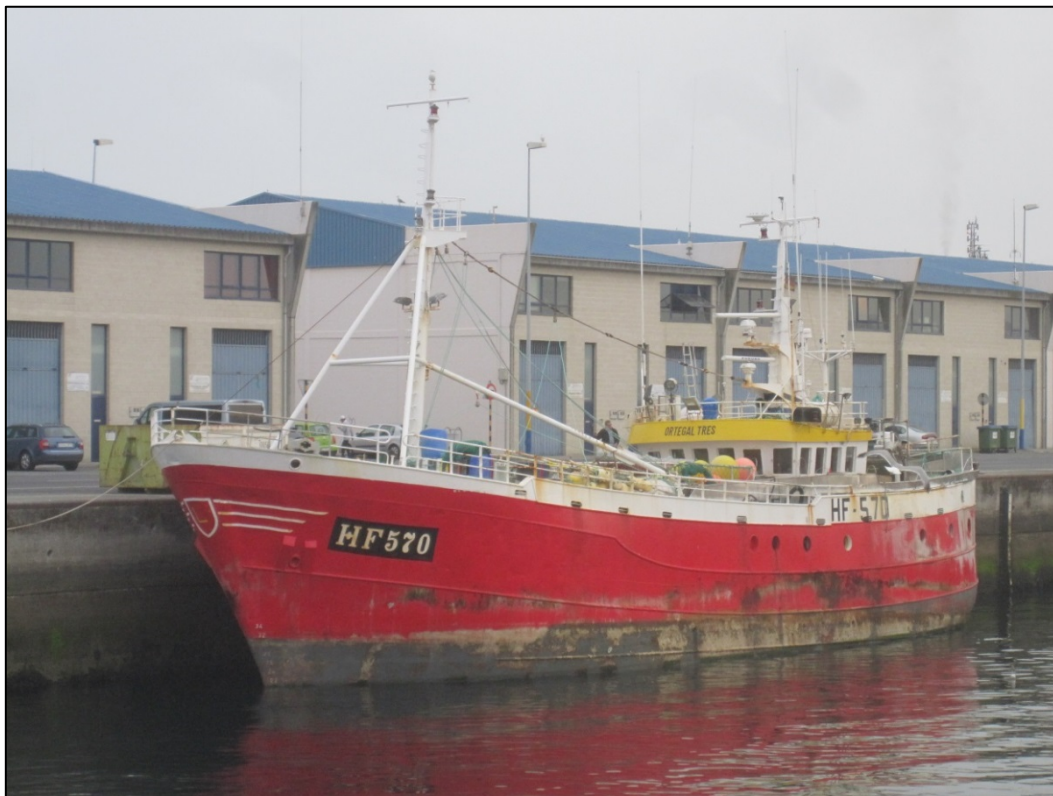
Figure 1: Photo of the ship