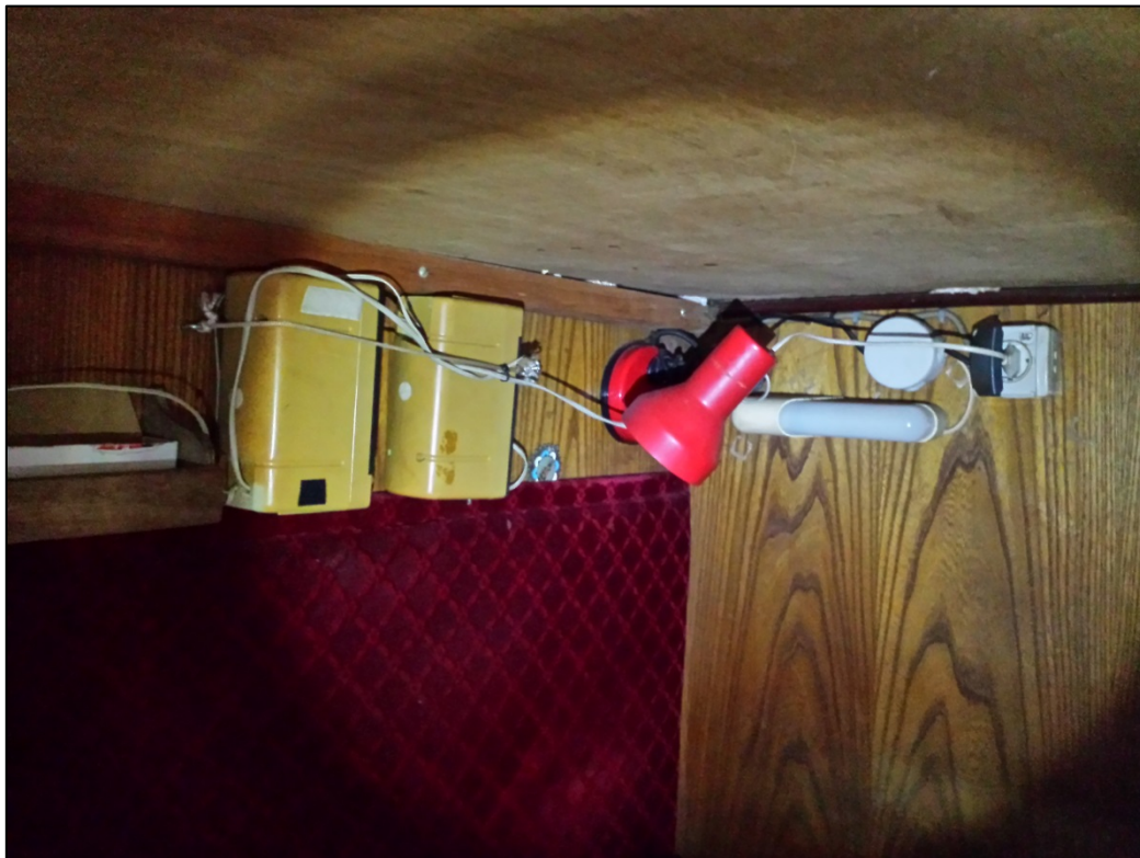
Figure 8: Additional wiring