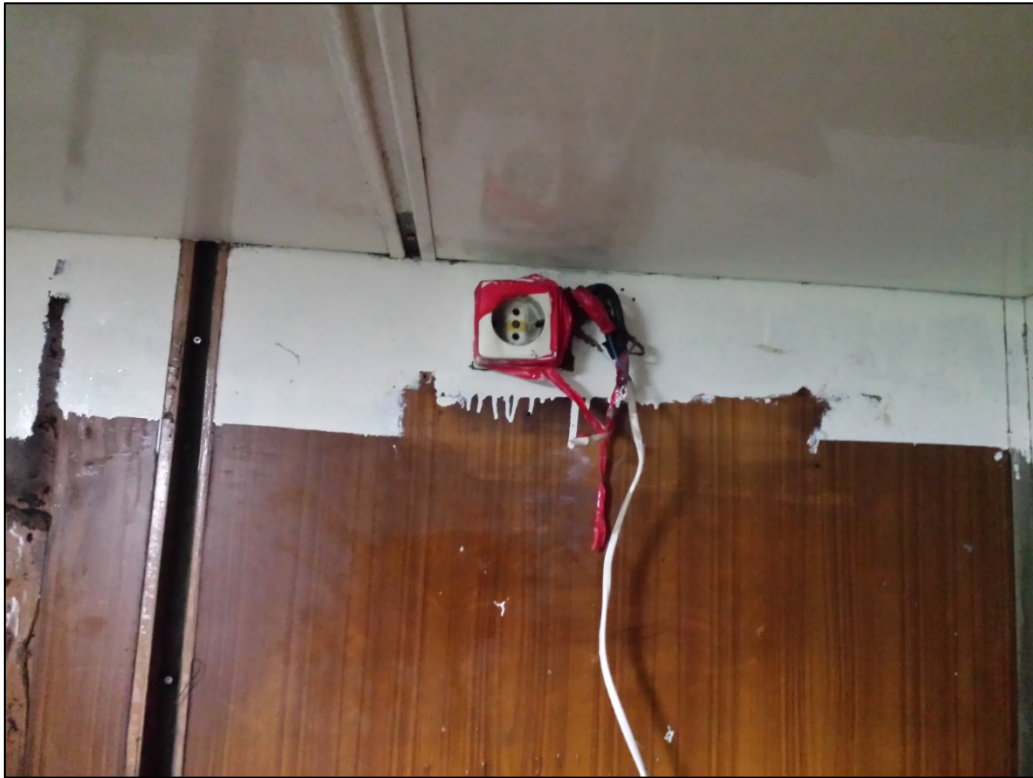
Figure 7: Socket in the cabin