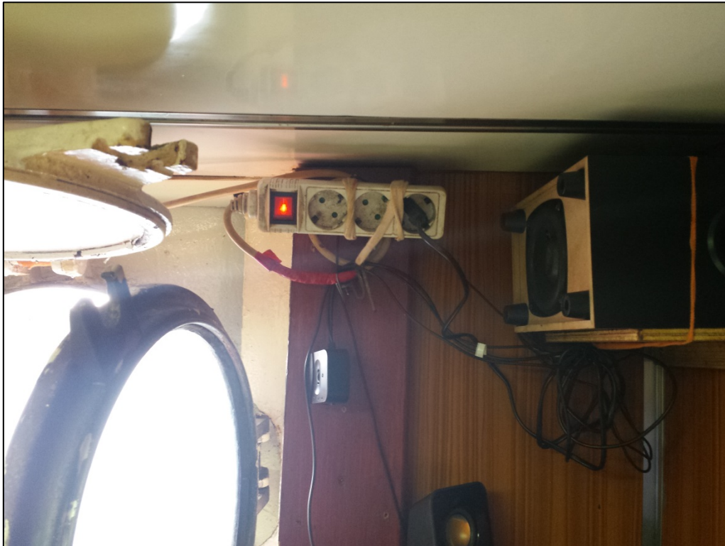
Figure 9: Socket strip on the bridge