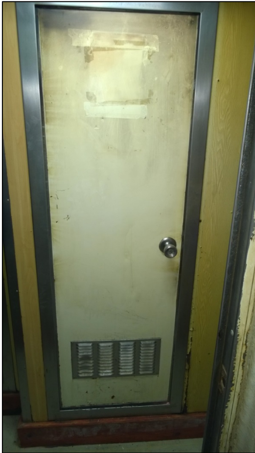
Figure 5: Cabin door