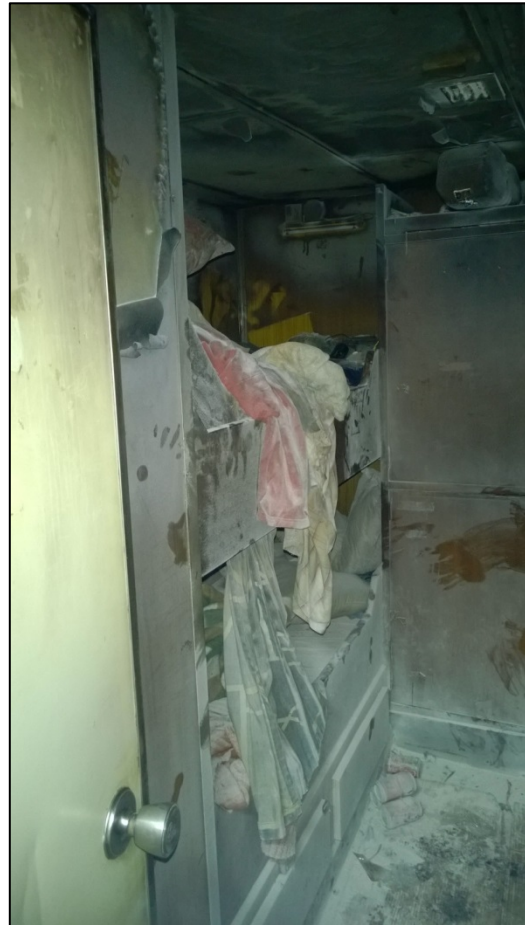
Figure 6: Casualty's berth