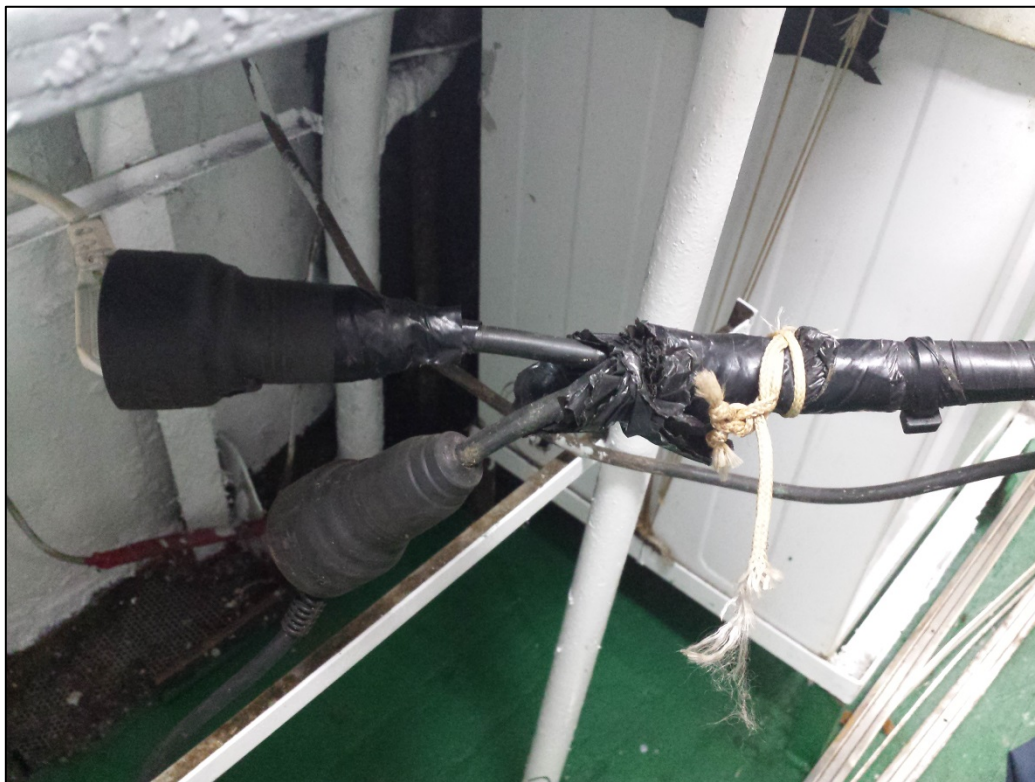
Figure 10: Plug on the main deck

For the normal, permanently installed heating, oil-fired electric radiators powered by 230 V alternating current are mounted on the walls. The fan heater that evidently