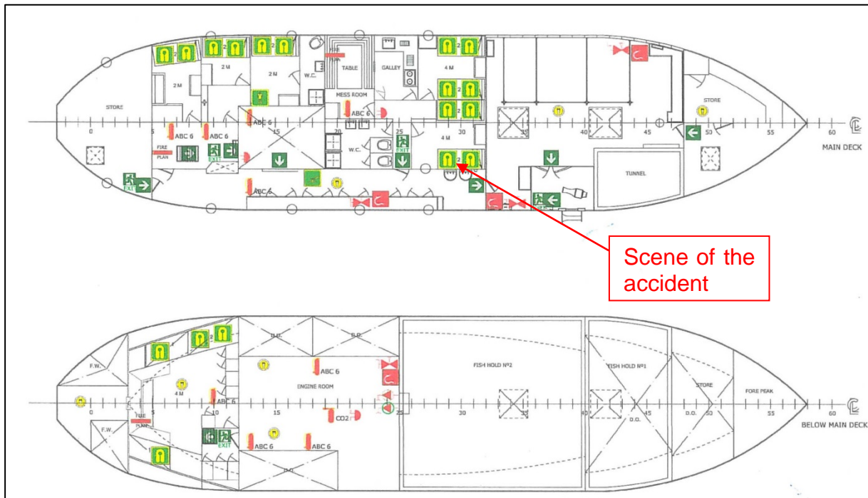
Figure 4: Extract from the general arrangement plan (top view)