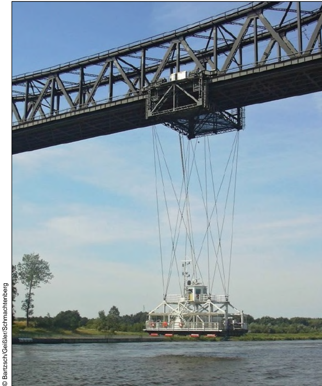
Figure 2: Photo of the Rendsburg transporter bridge