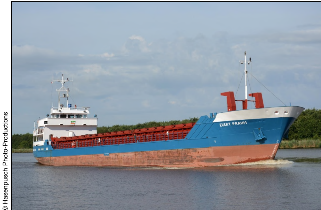
Figure 1: Photo of the EVERT PRAHM