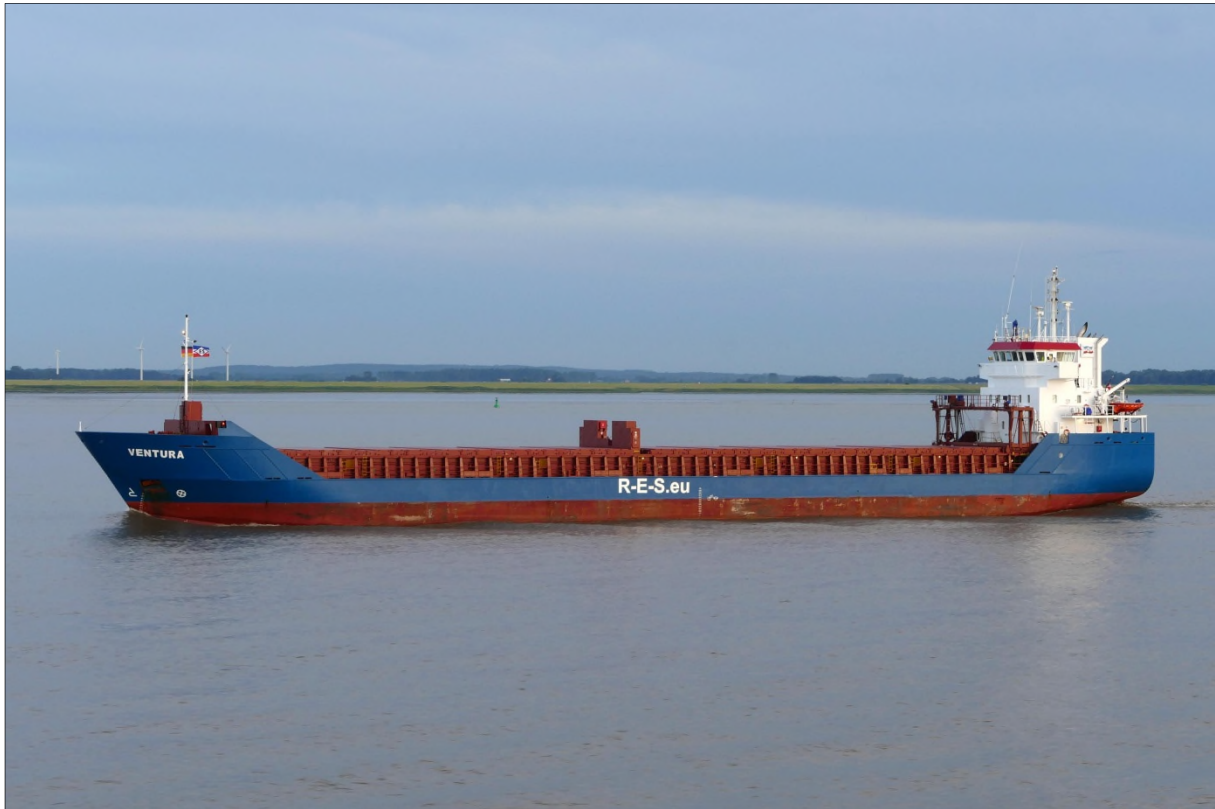
Figure 1: Photo of the ship