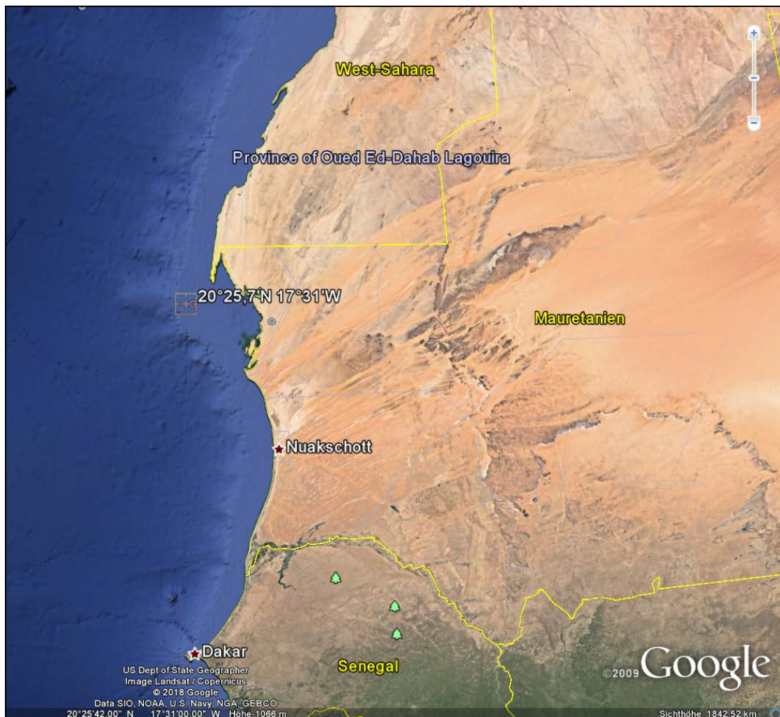
Figure 2: Scene of the accident

Type of marine casualty or incident: Very serious marine casualty Date, time: 21/03/2017 approx. 0113 UTC Location: Atlantic Ocean, Mauritanian EEZ Latitude/Longitude: approx. \phi 20°25,7 'N \lambda 017°31,0'W Ship operation and voyage segment: Preparation of fishing (search for fish) Consequences (for people, ship, cargo): Foundering of a fishing boat Death of three crewmembers of the fishing boat