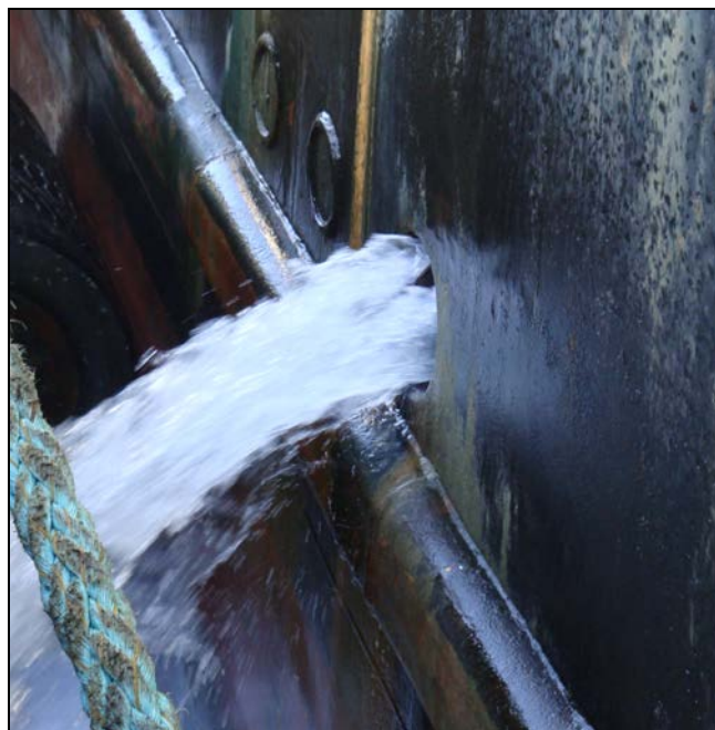
Figure 5: Escape of cooling water (in this case on the port side of JAN MARIA).

It is discernible in figure 4, that cooling water openings in the hull of JAN MARIA are located directly above the contact area of both vessels. At the time of the accident, a strong water jet visible in figure 3 and in the close-up view below (figure 4) burst out of these openings.