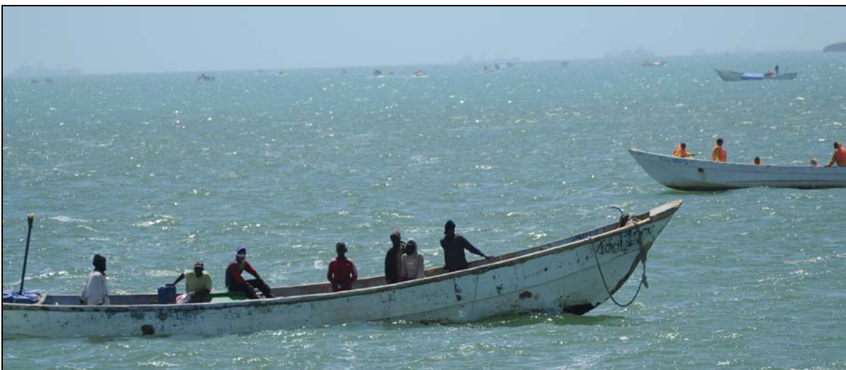
Figure 3: Fishing boats (pirogues) off the Mauritanian coast 1

The fishing boat, which was manned with 6 fishermen, is a so called pirogue that is a simple, open wooden boat (cf. below by way of illustration figure 3). Locals use this type of boat, inter alia, for extended inshore fishing at the Mauritanian coast. Usually they are not equipped with safety appliances, radio sets, radar reflectors and – if at all – are only sparsely lit in the night.