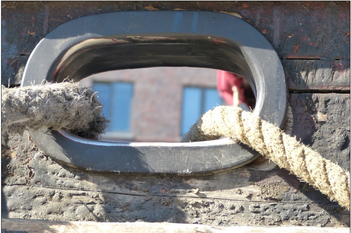
Figure 12: Hawsehole with a metal edge

In August 2018, the association stated that all hawseholes now had metal edges.