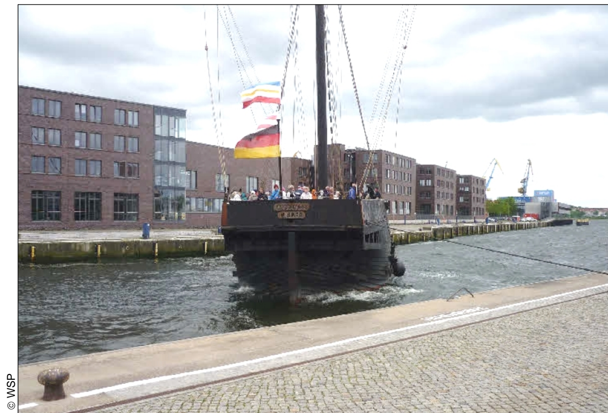
Figure 4: Berthing manoeuvre seen aft the stern

A 4-5 Bft north-west wind prevailed. The WISSEMARA moved slowly astern to the pier. The stern line was passed ashore with the help of a heaving line. The passengers were once more requested to move away from the mooring area on the starboard side for safety reasons. After the stern line was made fast ashore, the rudder was set to hard to starboard, the main engine to dead slow ahead, and the bow thruster operated at 100% to starboard. A strong gust of wind occurred at that precise moment, which turned the bow of the WISSEMARA to port. The main engine was once more briefly set to astern, so as to then spring on the stern line again while moving slowly ahead. When the stern line was then loaded, the cleat holding it broke. The flying wooden splinters that ensued struck a female passenger, who was still sitting in the danger area of the aft manoeuvring station despite all requests. She sustained minor injuries on her forehead.