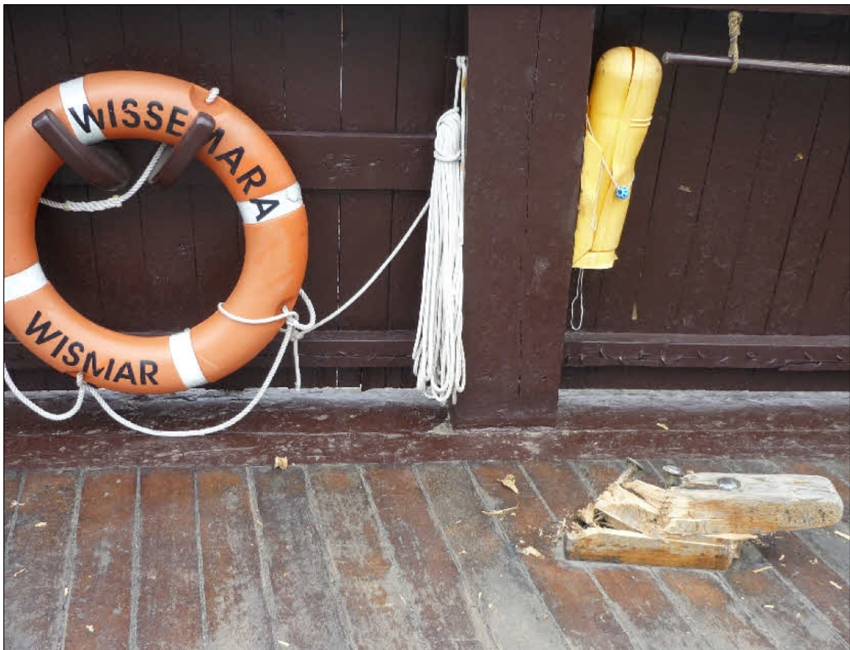
Figure 6: Destroyed wooden cleat (side view)

On the WISSEMARA, a wooden belaying cleat was destroyed (see Figures 6 and 7).