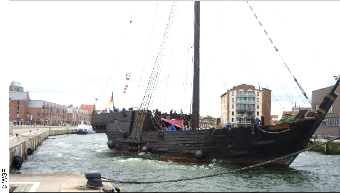
Figure 5: Berthing manoeuvre seen at the bow

A crew member who was also located there due to the berthing manoeuvre suffered minor injuries on his leg.