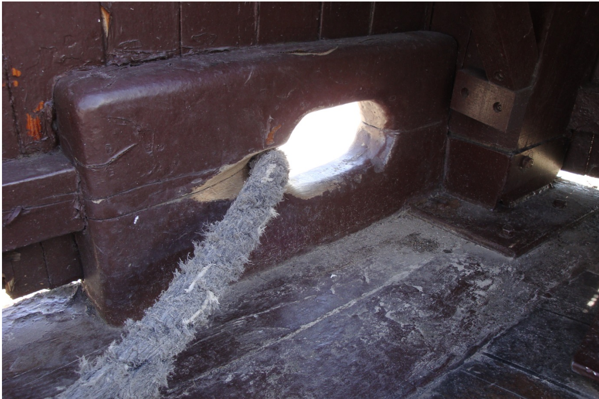
Figure 11: Wooden hawsehole with incision

It was found during the BSU's survey that the WISSEMARA's hawseholes were made of wood and therefore already damaged. It was clearly visible that the movement of the mooring lines had caused incisions in the hawseholes. Since modern technology was concealed throughout the ship by the 'charm' of the original cog, it is difficult to understand why the hawseholes and cleats were not installed according to current standards. It is unlikely that any passengers would be bothered if the internal parts of a hawsehole or cleat were made of metal. By contrast, this would increase the safety of everyone on board considerably.