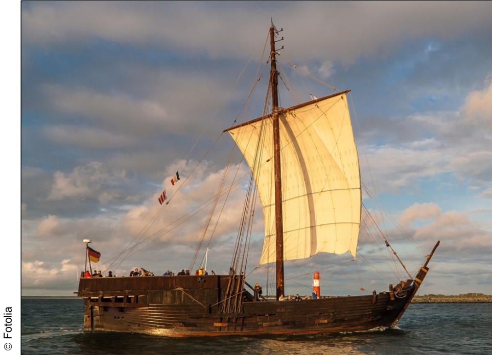
Figure 1: WISSEMARA