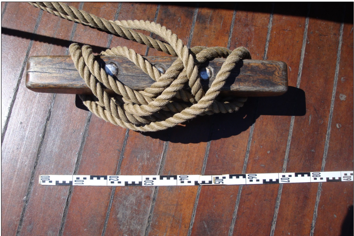
Figure 10: Example of a wooden cleat in use