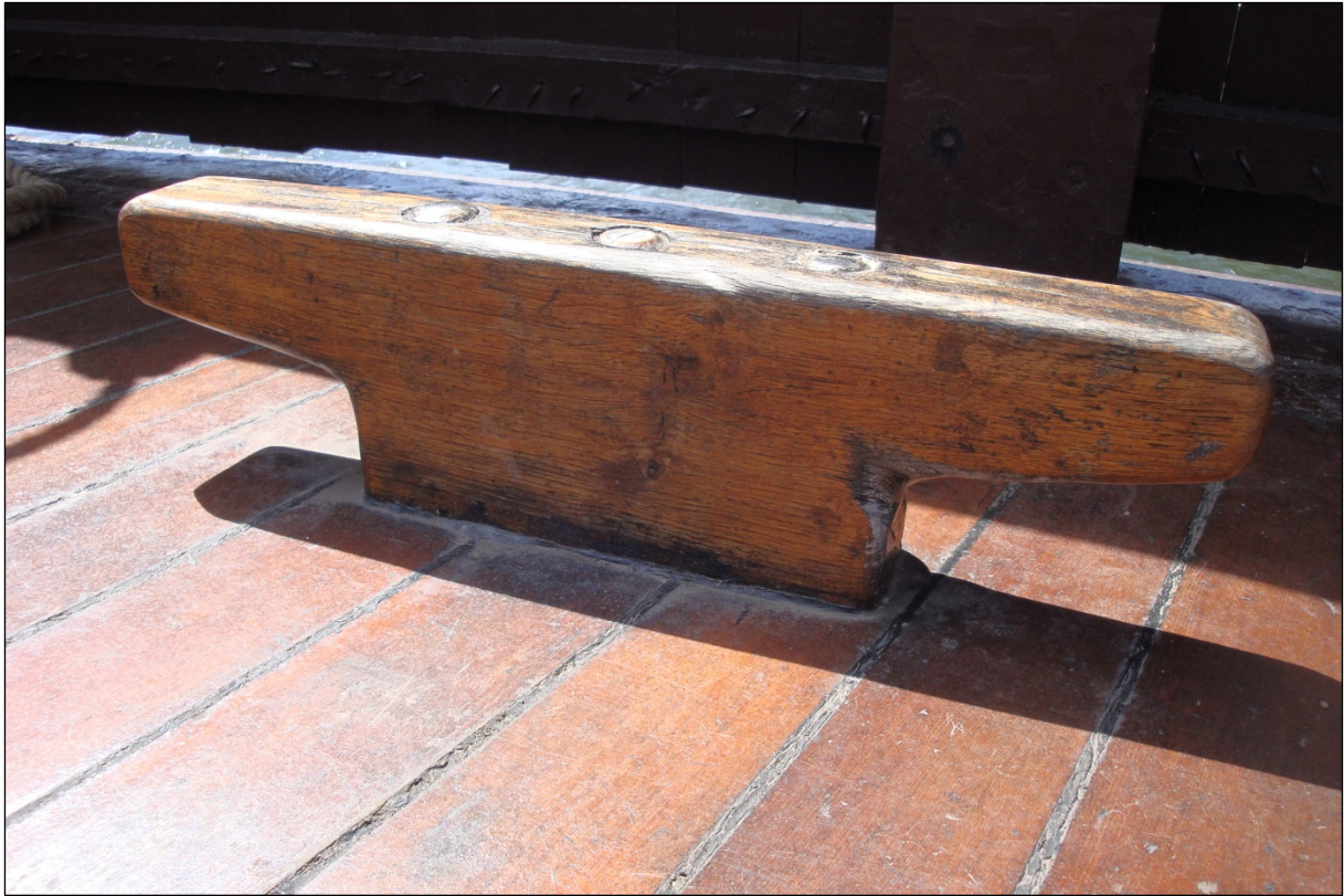
Figure 9: Example of an intact wooden cleat