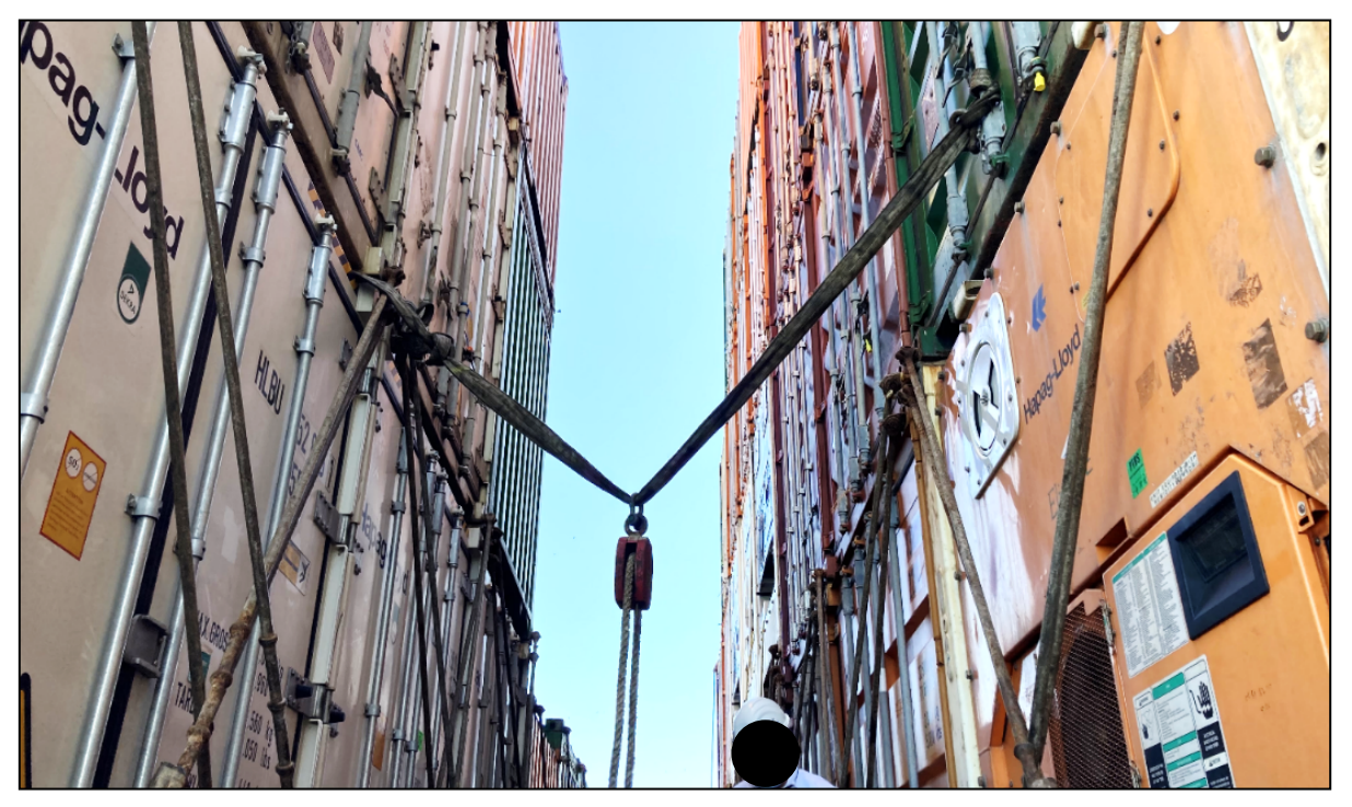
Figure 4: Sling Construction for Evacuation via the Access Hatch (simulated on 19/10/2021)<sup>15</sup>

At about 0817, the Chief Officer and an AB (AB1) descended into the cargo hold No. 3 both wearing a SCBA and reached the casualty two minutes later on the No. 4 stringer deck. He suffered a bleeding wound at the back of his head and showed no reaction. The Chief Officer tried in vain to find a pulse on both the neck and wrist. He informed the Chief Engineer at the access hatch that the injured person should be pulled up by means of a rescue sling. The Chief Officer ascended the ladder again in order to prepare the rescue rope, which had to be attached to the loaded containers or their lashing materials due to the lack of suitable fastening points (see Figure 4). Meanwhile, another AB joined them, equipped himself with a SCBA, descended to the No. 4 stringer deck together with the Chief Officer and AB1, and helped to first lift the unconscious watchman into the sling and then to lead him upwards by the rope. The Chief Engineer and Bosun operated the rope at the access hatch.