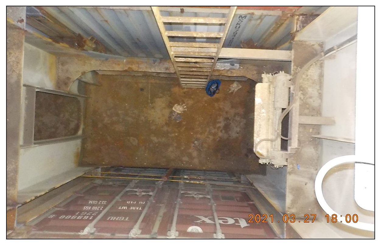
Figure 6: View from Above onto the 4th Stringer Deck in Cargo Hold No. 3, Scene of the Accident<sup>17</sup>

Figure 6 shows the view from the No. 2 stringer deck to the No. 4 stringer deck below, where the injured watchman was found at the base of the vertical ladder, his helmet and gloves also visible in the picture.