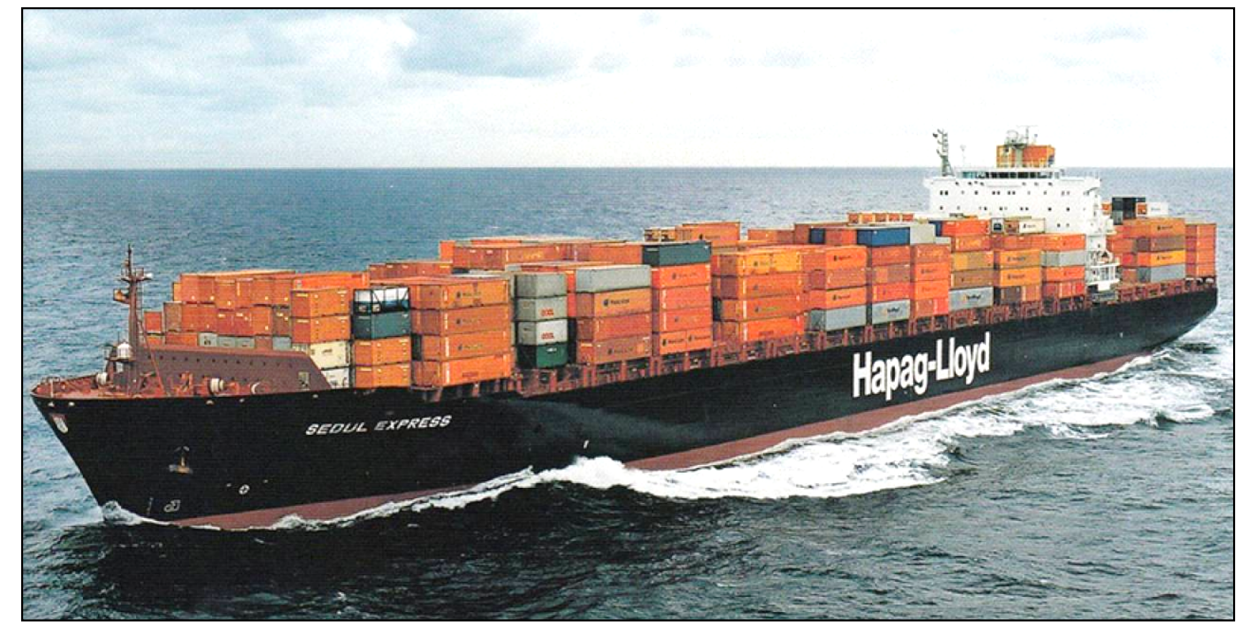
Figure 1: Ship Photo SEOUL EXPRESS<sup>1</sup>