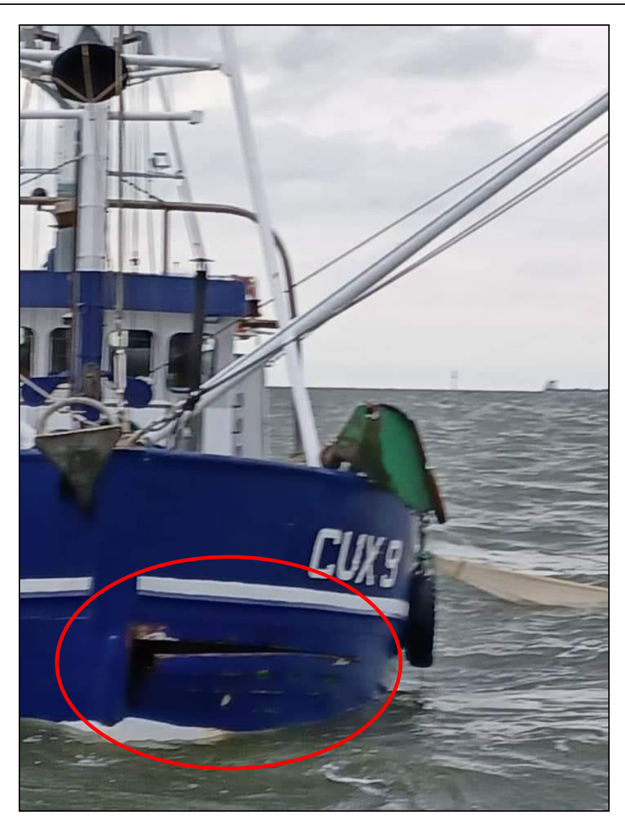
Figure 3: The loose planks at the bow of the RAMONA<sup>5</sup>

Figure 3 shows the protruding planks at the RAMONA's bow. Unfortunately, the figure is only available in poor quality. However, the BSU is grateful for the presence of mind of the crew of the rescue cruiser ANNELIESE KRAMER who took photos in this distress situation. This way, investigations into the cause of the accident at least get some clues.