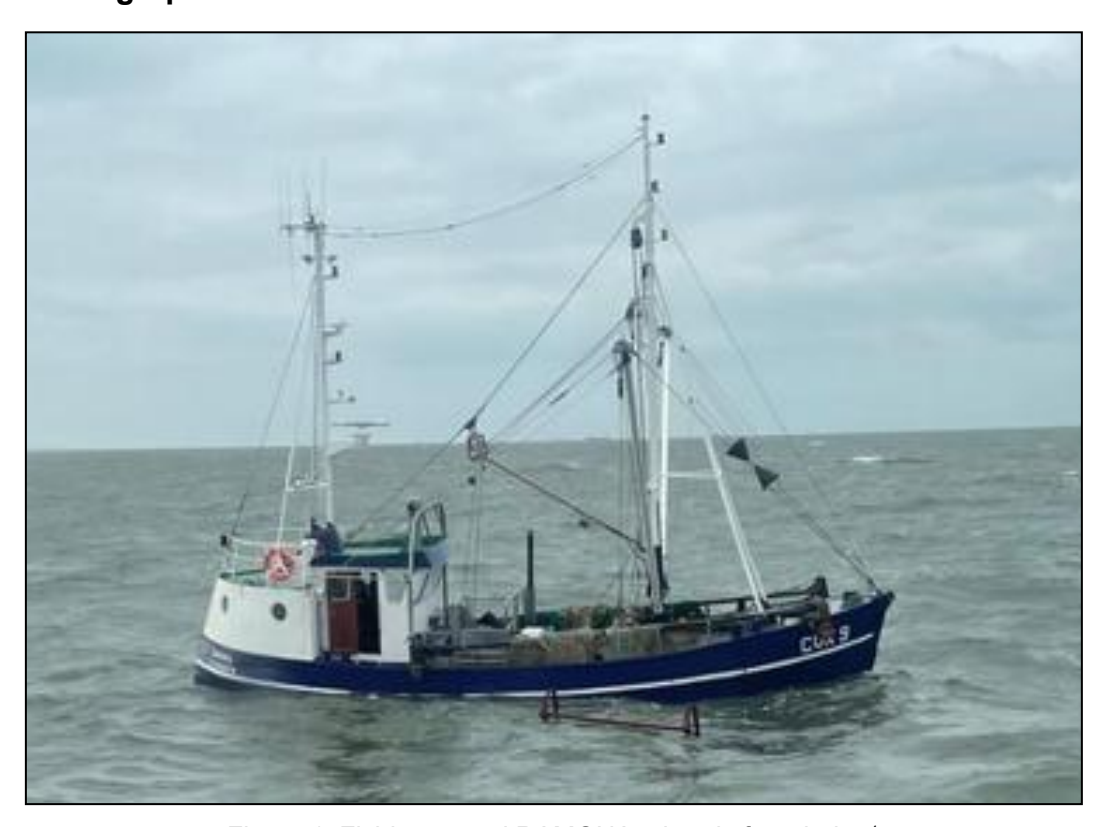
Figure 1: Fishing vessel RAMONA, already foundering<sup>1</sup>