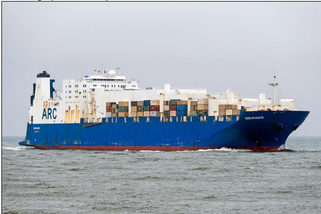
Figure 1: ENDURANCE 1