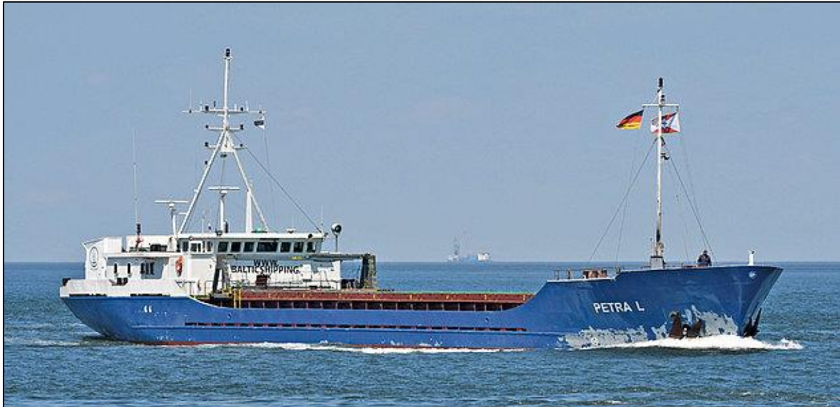
Figure 1: The undamaged PETRA L 1