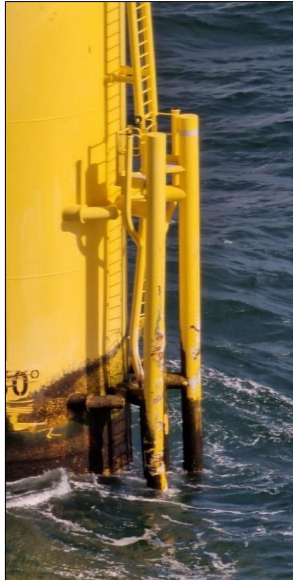
Figure 6: Struck wind turbine in detail 5

In addition to the minimum safe manning of seagoing ships, the focal points of this particular investigation are the monitoring of shipping traffic by the VTS Wilhelmshaven (German Bight Traffic) as well as the monitoring centre of the wind farm operator.