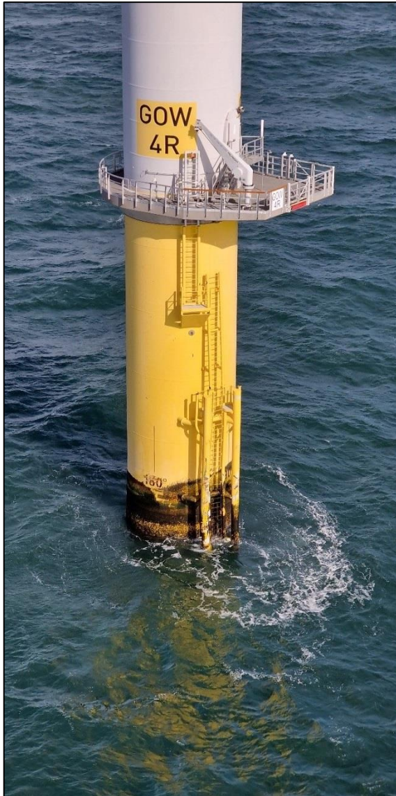
Figure 5: Struck wind turbine in overview