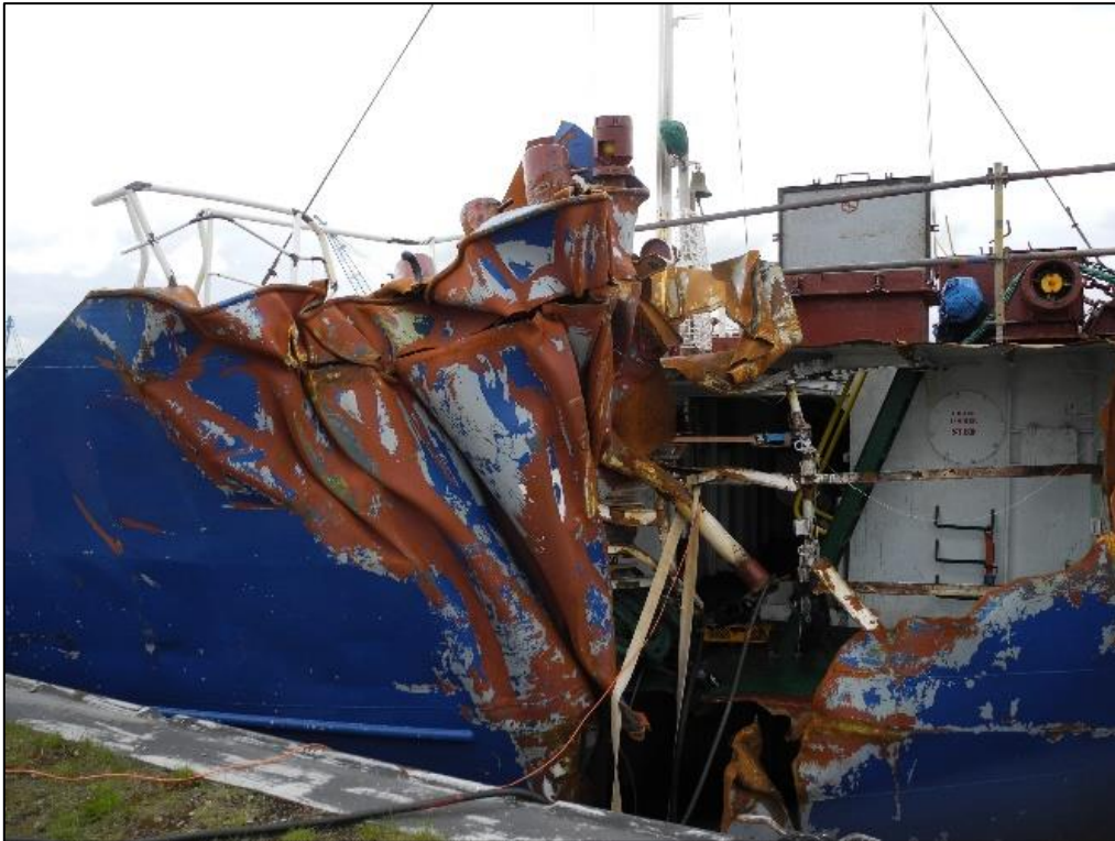
Figure 3: The torn open starboard side of the PETRA L 3